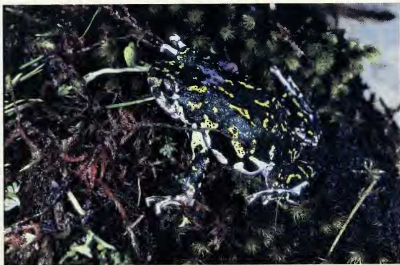
Fig. 1. Holotype of Eleutherodactylus philipi , KU 202592, ♀, SVL 33.1 mm. KU Color transparency No. 7241.

edge of tarsus (most distinct in smaller individuals); small elongate tubercle on inner margin of tarsus; inner metatarsal tubercle twice as long as wide, about 3\times round outer metatarsal tubercle; subarticular tubercles round, prominent, nonconical; supernumerary plantar tubercles low, those at bases of toes most distinct; toes bearing lateral keels; digital disks of toes slightly smaller than those of fingers but more obvious and more truncate; tip of disc of Toe V extending to distal edge of distal subarticular tubercle on Toe IV; tip of disc on Toe III extending to distal edge of penultimate subarticular tubercle on Toe IV; heels of flexed hind limbs held at right angles to sagittal plane not touching; shank 36.2–41.2% ( \bar{x} = 38.4 \pm 0.5 ) SVL in males, 34.7–41.8% ( \bar{x} = 38.4 \pm 1.0 ) in females.